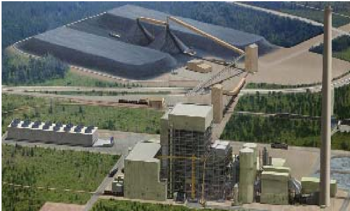
John W. Turk, Jr. Power Plant

OMPA is a joint-action agency created for the purpose of providing an adequate, reliable and affordable supply of electrical power and energy to Oklahoma's municipally owned electric systems. OMPA is a consumer-owned public power entity and is guided by its vision and mission statements.